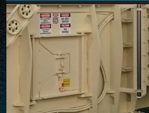
Lower ram chassis inspection door for easy maintenance access.