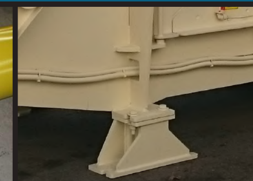
Raiser kit allows for easy cleaning and clearing around baler.

PROPAK SHEAR BALERS - LEADING THE WAY IN PAPER CONVERTING BALING