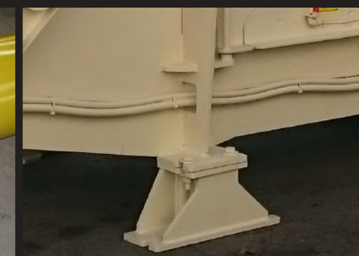
Raiser kit allows for easy cleaning and clearing around baler.

PROPAK SHEAR BALERS - LEADING THE WAY IN PAPER CONVERTING BALING