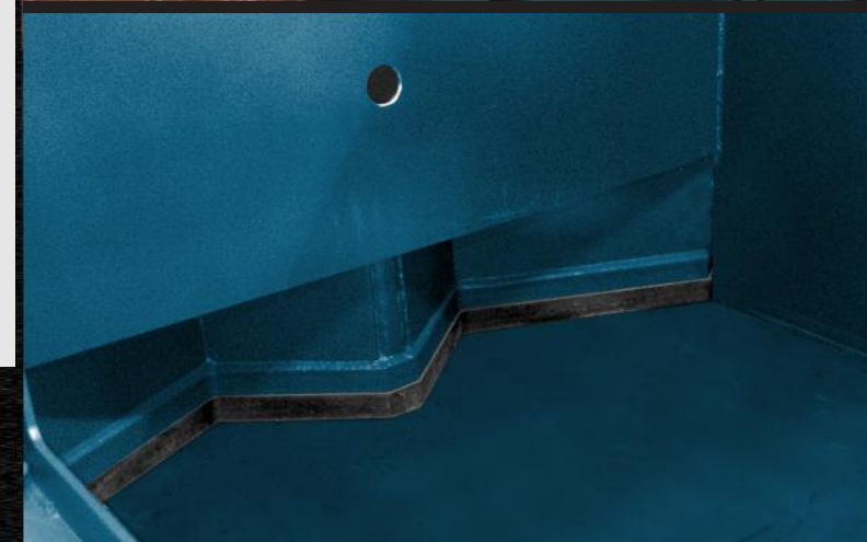
Hardened tool steel progressive shear blade and 30" penetration all but eliminates shear jams.