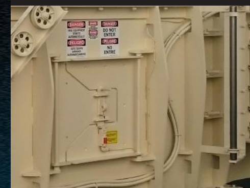
Lower ram chassis inspection door for easy maintenance access.