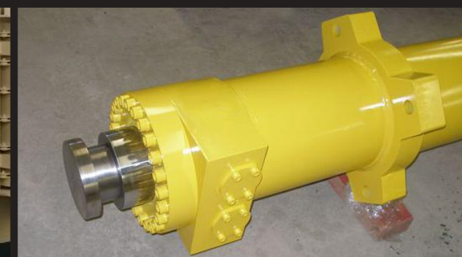
Key lock cylinder design provides maximum cylinder mount durability and allows easy maintenance access.